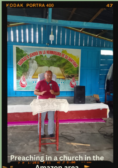
Preaching in a church in the Amazon area