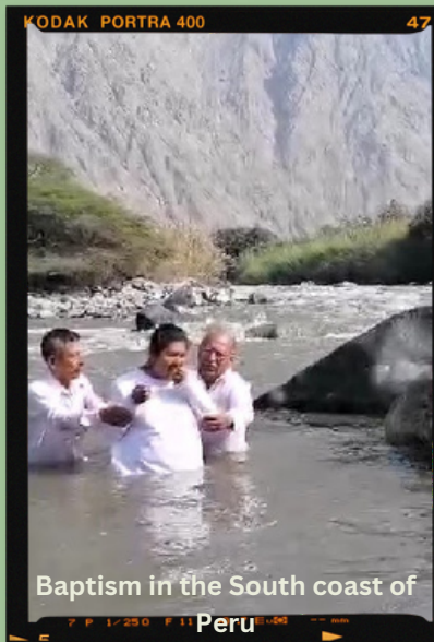
Baptism in the South coast of Peru