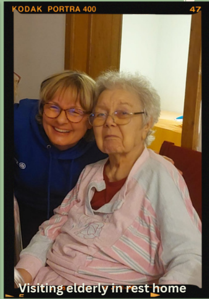
Visiting elderly in rest home