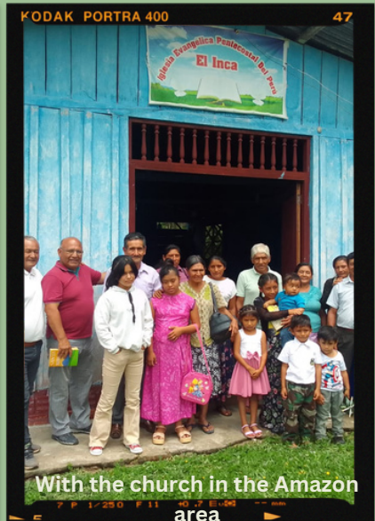
With the church in the Amazon area