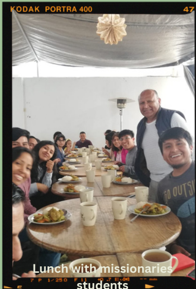
Lunch with missionaries students