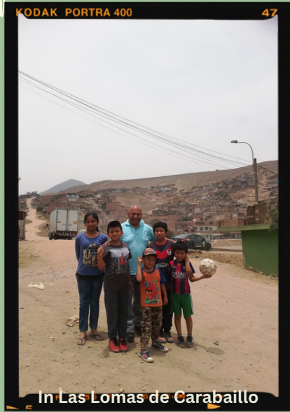
In Las Lomas de Carabaillo